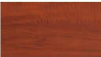
Asian Cherry FL-LF50-AC-J-11682