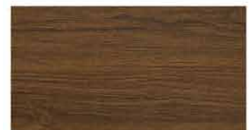
Colored Walnut FL-LF50-CW-J-11684