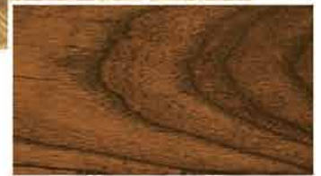
Ash Jacobean FL-EF-T15-AJ-7726