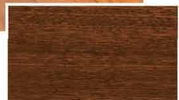
Mahogany Natural FL-EF-T15-MN-11244