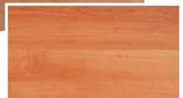
Mountain Birch FL-LF50-MB-4666