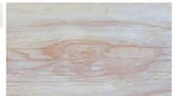
Classic Hemlock FL-LF50-CH-4664