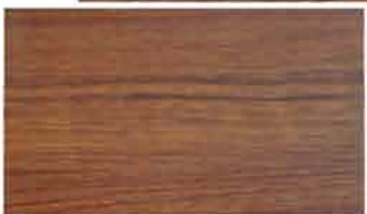
Dark Teak FL-LF50-DT-4665