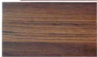
Java Teak FL-LF50-JT-2656