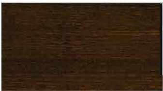
Teak Walnut FL-EF-T15-TW-11319