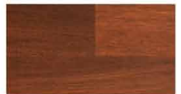
Brazil Alder FL-LF50-BA-11341