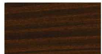
Mahogany Teak FL-EF-T15-MT-11321