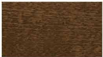
Beech Walnut FL-EF-T15-BW-11320