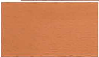
Beech Natural FL-EF-T15-BN-11303