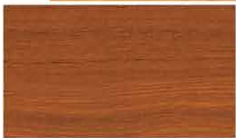
Teak Natural FL-EF-T15-TN-4870