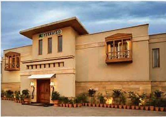
Garden Town Lahore