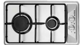
KP-A-HB-2B30 2 Gas Burners, Auto-Electric Ignition, 1 ft Size: 300mm