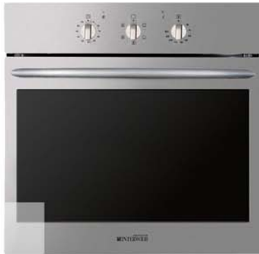
KP-A-OV-B60 Electric multifunction ventilated 5+0 H x W x D 600x454x540mm