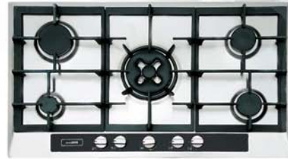
KP-A-HB-90PIF 5 Gas with 1 "Triple Flame" Burners (Matt Finish), Auto-Electric Ignition 3ft Size: 900mm