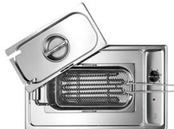
KP-A-HB-FR30 Deep Fryer Electric. 1 ft Size: 300mm