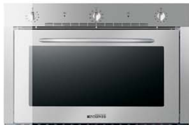
KP-A-OV-88-990 Multifunction oven 9+0 H x W x D 597x915x555mm