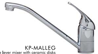
KP-MALLEG Single lever mixer with ceramic disks