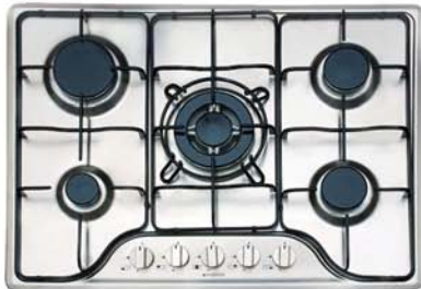
KP-A-HB-5B70 5 Gas with 1 "Triple Flame" Burners. Auto-Electric Ignition. 2.35ft Size: 700mm