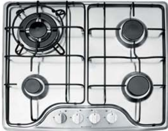
KP-A-HB-4B60 4 Gas with 1 "Triple Flame" Burners. Auto-Electric Ignition. 2ft Size: 600mm