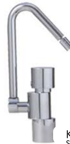
KP-MACCOR Single lever mixer with ceramic disks