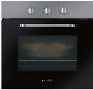
KP-A-OV-B60 Gas / Electric multifunction Oven 5+0 with fan H x W x D 600x454x540mm