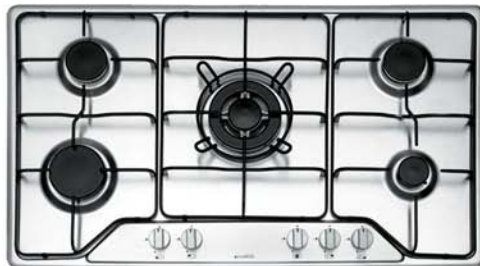
KP-A-HB-5B90 5 Gas with 1 "Triple Flame" Burners. Auto-Electric Ignition. 3ft Size: 900mm