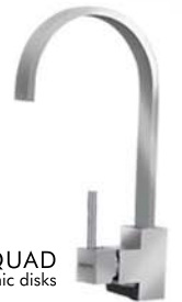
KP-MQUAD Single lever mixer with ceramic disks